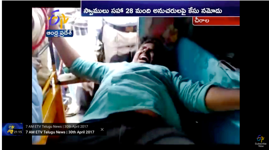
The journalist assaulted in Chirala.

In the period being reported on, 54 attacks on journalists in India were reported in the media, according to the Hoot's compilation. The actual number will certainly be bigger, because last week Minister of State for Home Affairs Hansraj Ahir said during question hour in the Lok Sabha that 142 attacks on journalists took place between 2014-15.